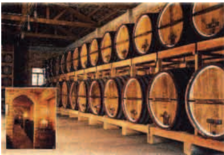
Wine aging in wooden casks in Vale dos Vinhedos