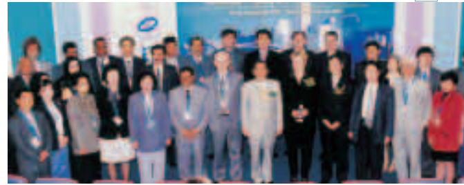
Conference participants in Hong Kong

Speakers in the workshop stressed the need to identify and maximize public intellectual property assets and to minimize the risk of infringement, noting that in many developing countries research and development activities are still very much in the hands of the public sector. They noted that, as government is still a major investor in research and development activities in public universities and research institutions, it is crucial to create a supportive environment for these activities. This includes making public intellectual property assets relevant to industries and the public, providing incentives for inventive activities, as well as creating a "critical mass" of intellectual property literate citizens through awareness building.