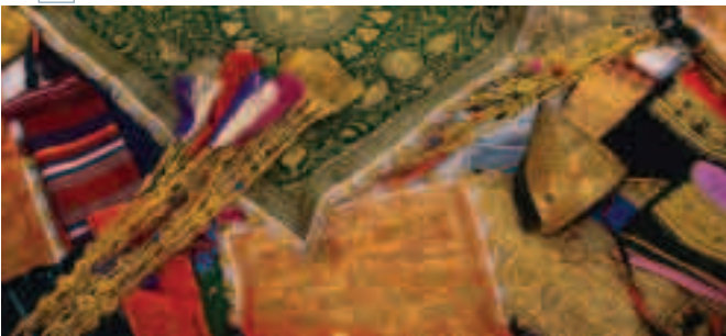
Textiles from Tunisia

The second meeting of the WIPO Intergovernmental Committee on Intellectual Property and Genetic Resources, Traditional Knowledge and Folklore (IGC), held in Geneva from December 10 to 14, approved further work within WIPO on the intellectual property aspects of the documentation of public domain traditional knowledge and its inclusion in the patent examination process as part of searchable prior art. This would make a useful contribution in addressing complaints relating to the grant of patents on traditional knowledge.