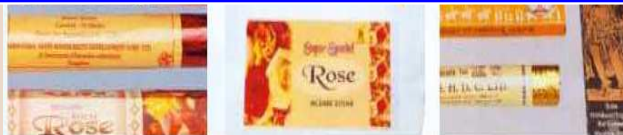
Mysore Agarbathi (incense sticks)