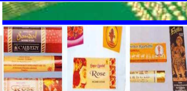
Mysore Agarbathi (incense sticks)