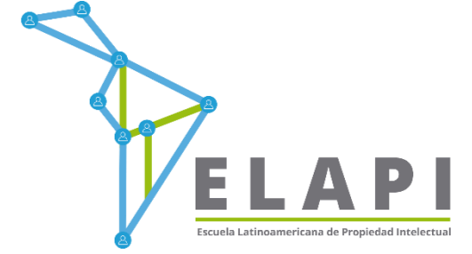
Latin American School of Intellectual Property (ELAPI)