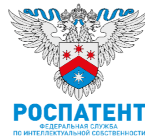
Federal Service for Intellectual Property of the Russian Federation (ROSPATENT)