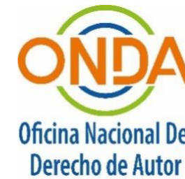
National Copyright Office (ONDA) (Dominican Republic)