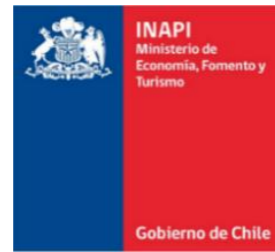
National Institute of Industrial Property (INAPI) (Chile)