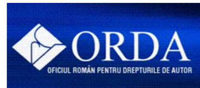
Romanian Copyright Office (ORDA)