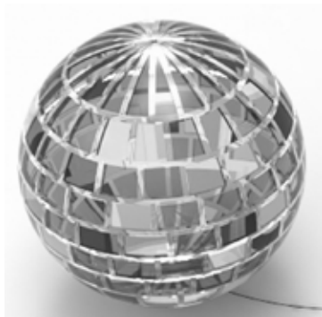
Floor lamp – DM/081858 WIN SRL

While the functional elements of a lamp will generally not differ significantly from product to product, its appearance is likely to be one of the major determinants of success in the marketplace. This is why industrial registers in many countries have a long list of designs for household products such as lamps.