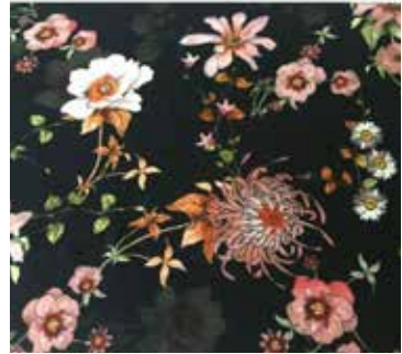
Fabric patterns – DM/094167 IPEKER TEKSTIL

In some countries, the applicable law recognizes the possibility of copyright protection for some designs, for example those incorporated in textiles and fabrics.