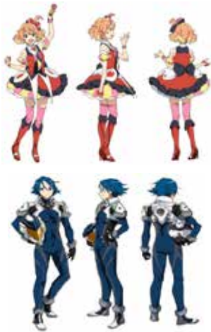
DM/097710 KABUSHIKI KAISHA BIGWEST