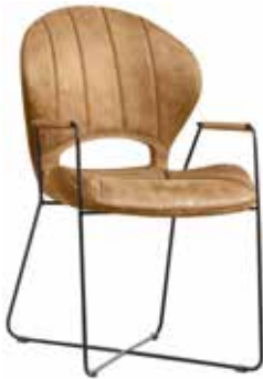
Armchair – DM/096353 FONKEL MEUBELMARKETING

In everyday language, an industrial design generally refers to a product's overall form and function. An armchair is said to have a "good design" when it is comfortable to sit in and we like the way it looks. For businesses, designing a product generally implies developing the product's functional and aesthetic features, taking into consideration issues such as the product's marketability, manufacturing costs and ease of transport, storage, repair and disposal.