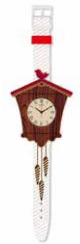
Wristwatch – DM/091792 SWATCH AG