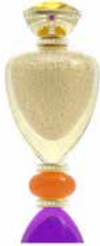
Bottle of perfume – DM/083330 BULGARI SPA