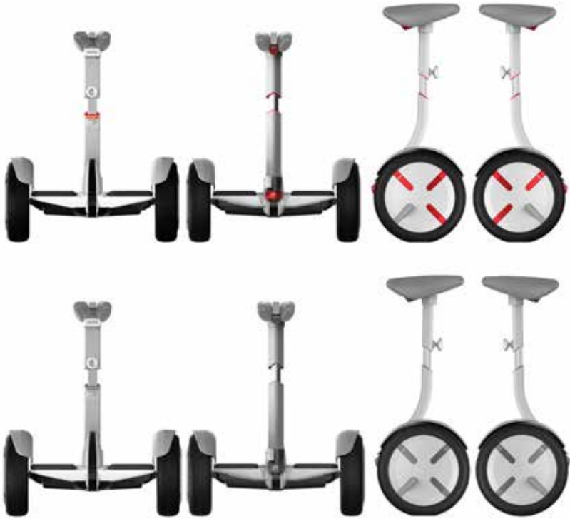
Two wheeled balancing scooters – DM/089858 NINEBOT (BEIJING) TECH. CO., LTD