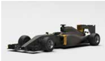
Miniature vehicle (toy) – DM/090181 RENAULT S.A.S