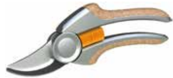
Pruner – DM/077406 FISKARS FINLAND OY AB

Thus, while competitors cannot be stopped from making competitive products, they may be prevented from copying or making products that look just like registered designs and “free riding” on the creativity of others.