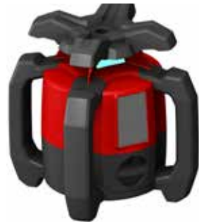
Rotation lasers – DM/082519 HILTI AKTIENGESELLSCHAFT

The Hilti rotation lasers used in the construction industry are protected not only by design rights but also by trademark and patent rights.