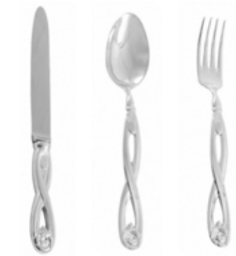
Set of cutlery – DM/080996 SAVIO FIRMINO DI SAVIO GUIDO E C. S.N.C