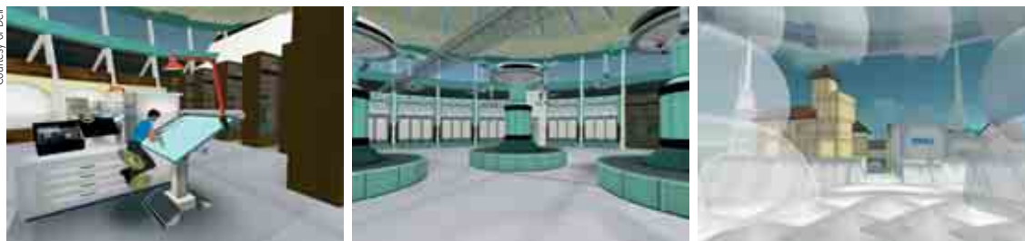
Dell Computers has established a factory and virtual store in Second Life.