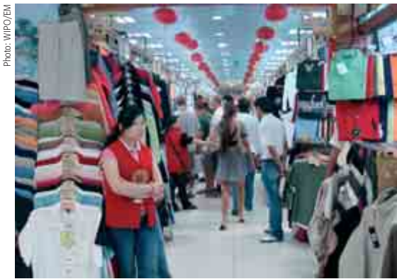
Tourists flock to Beijing's Silk Market each day in search of bargains.