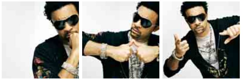
“You have to reinvent yourself.”

Normally there are three ways to do that: a gun tune, a dance tune, or a girl tune. Well, I don’t do gun tunes, you don’t want to see me dance, and a girl tune