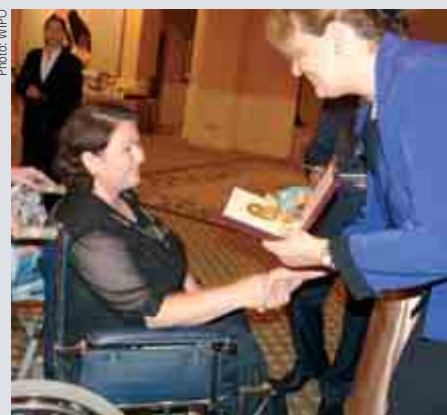
15 disabled innovators and artists in Azerbaijan won WIPO Awards for achievements spanning poetry and geo-physics.

tors, innovators and artists at an exceptional ceremony held in Baku, Azerbaijan, in October. The event highlighted the fact that intellectual property is an important national asset, and that all members of society should have an equal right and equal opportunities to contribute to the inventive, technological and creative development of their countries, and to have their contributions recognized. Through the awards to these disabled scientists and artists – whose achievements span fields as diverse as poetry, engraving and geophysics – WIPO hopes to further the recognition of inventors, innovators and artists around the world, able-bodied or disabled, regardless of age, gender and nationality.