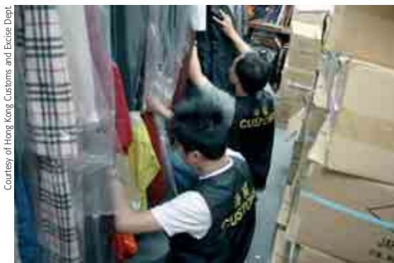
Fashion police. Hong Kong's custom officers search for fake brands.