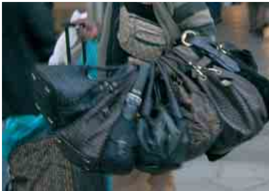
Peddlers of fake designer bags appeal to bargain hunters in the stylish shopping streets of Venice.

Stereotypes certainly. But which reflect two very different markets, and two very different consumer mindsets to work with if you're trying to determine what sort of message would convince one or other of them not to buy fakes.