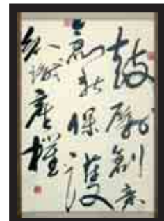
“Encouraging Creativity – Protect IP”