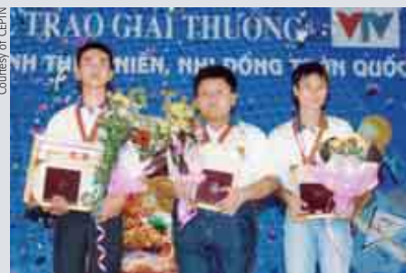
Winners of Viet Nam's Nationwide Creativity Competition for Youth.

Viet Nam's third Nationwide Creativity Competition for Youth, held in September, attracted some 1000 young inventors bursting with ideas. The event, which aims to promote and encourage the inventors of tomorrow, was broadcast live on national television and abroad. The government actively supports the Competition and many government ministers, including Viet Nam's Vice-President, participated in the ceremony. WIPO was pleased to support the event by awarding three WIPO gold medals for Best Young Inventor. ■