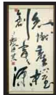
“IP – A Tool for wealth creation”