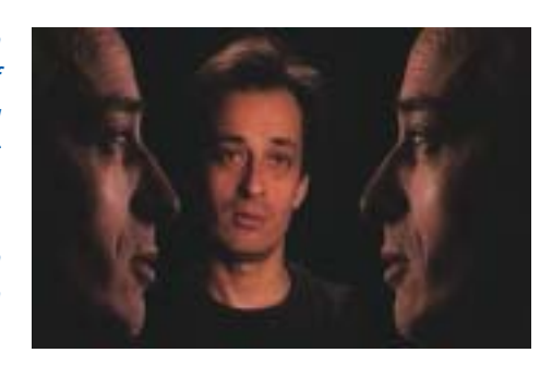
On being innovative

I create watches because gears, mobiles and mechanisms fascinate me. I make them the way I imagine them, the way I feel they should look. You have to innovate, not just re-do – in a mechanical way, I'd say – what's already been done by others. In watch-making, it's not always easy to innovate or create specific things, but you have to come up with your own ideas, something which will be remembered for years to come.