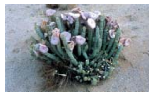
The Hoodia plant

milestone payments<sup>2</sup> received from the licensee by CSIR as well as 6 percent of any royalties CSIR receives on sales of the final product. Reports estimate that the milestone payments will amount to some US$1 to $1.5 million, while royalty payments could bring additional millions to the economically poor San.