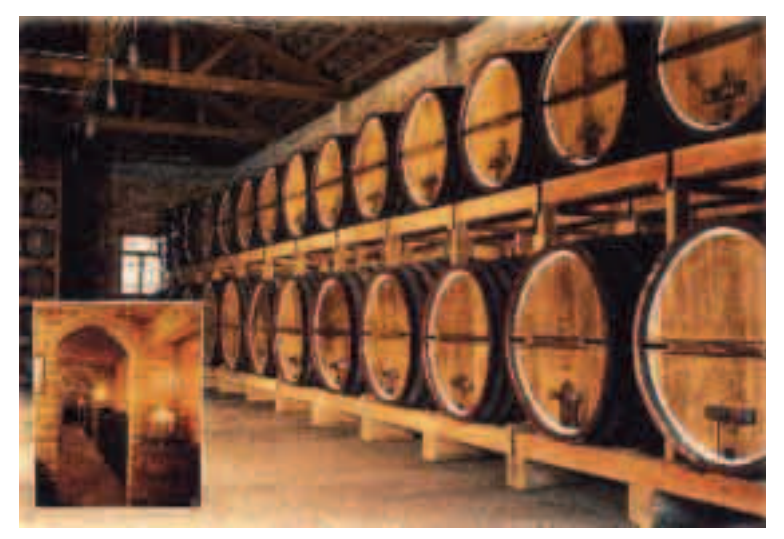
Wine aging in wooden casks in Vale dos Vinhedos