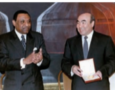
Dr. Idris and President Akaev

At a meeting in Bishkek on February 21, President Askar Akaev of Kyrgyzstan and WIPO Director General Dr. Karim Idris discussed