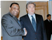
Dr. Idris and Prime Minister Tokaev