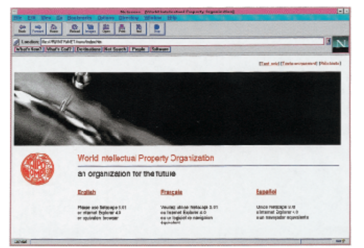
In August 1998, more than 100,000 pages of information were transferred via the WIPO web site every week, http://www.wipo.int