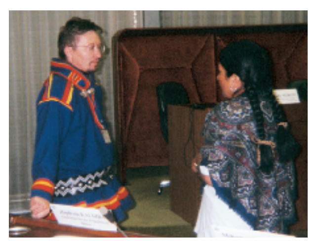
Participants at WIPO's first Roundtable for Indigenous Peoples.

There is a broad and deep lack of awareness of intellectual property rights among indigenous peoples, which leads to a lack of consideration of these avenues of protection. The Roundtable was organized under a new WIPO program