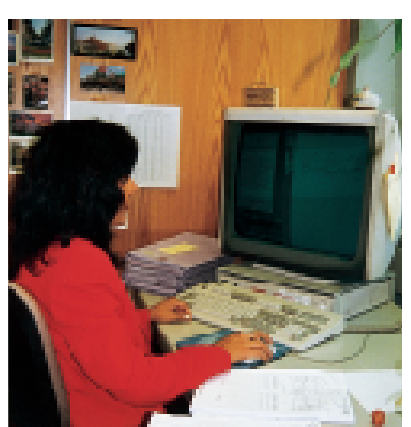
Automated processing of applications under the PCT.

developing an electronic document management system for handling the increasing number of international applications, whether in electronic or paper form;