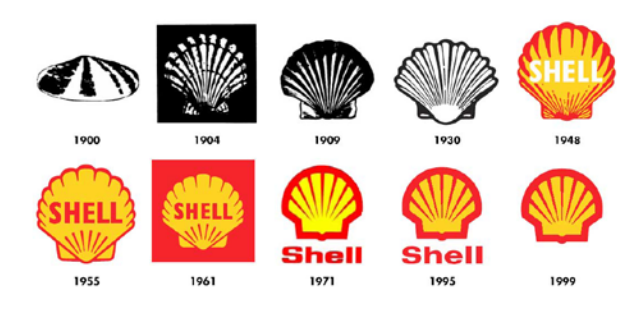
The SHELL® logo is property of the Royal Dutch Shell group of companies.

Many trademarks have changed slightly over the years in order to modernize the image of a business or adapt to new advertising media. You will have to consult with the trademark office(s) concerned or a trademark agent as to whether a specific change will require the submission of a new application and payment of relevant fees.