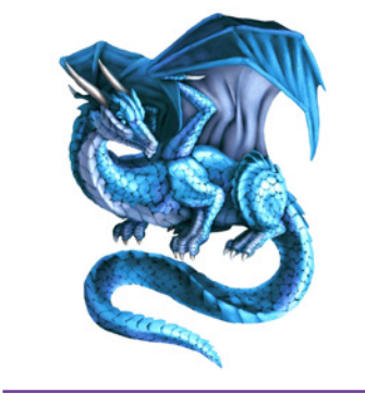
DM/086533 RP-TECHNIK GMBH

Traditionally, designs relate to features of manufactured products, such as the shape of a shoe, the design of an earring or the ornamentation on a teapot. In the digital world , however, design protection is gradually extending to new products and types of design. These include, for instance, electronic desktop icons generated by computer codes, typefaces, the graphic display on computer monitors and smartphones, and so on.