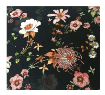
Fabric patterns – DM/094167 IPEKER TEKSTIL

In some countries, the applicable law recognizes the possibility of copyright protection for some designs, for example those incorporated in textiles and fabrics.