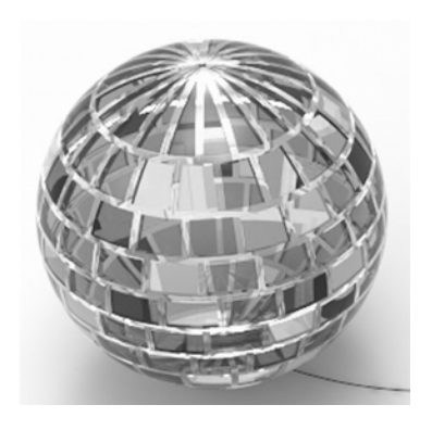
Floor lamp - DM/081858 WIN SRL

While the functional elements of a lamp will generally not differ significantly from product to product, its appearance is likely to be one of the major determinants of success in the marketplace. This is why industrial registers in many countries have a long list of designs for household products such as lamps.