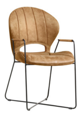
Armchair – DM/096353 FONKEL MEUBELMARKETING

In everyday language, an industrial design generally refers to a product's overall form and function. An armchair is said to have a "good design" when it is comfortable to sit in and we like the way it looks. For businesses, designing a product generally implies developing the product's functional and aesthetic features, taking into consideration issues such as the product's marketability, manufacturing costs and ease of transport, storage, repair and disposal.