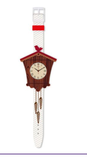
Wristwatch - DM/091792 SWATCH AG