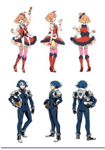
DM/097710 KABUSHIKI KAISHA BIGWEST