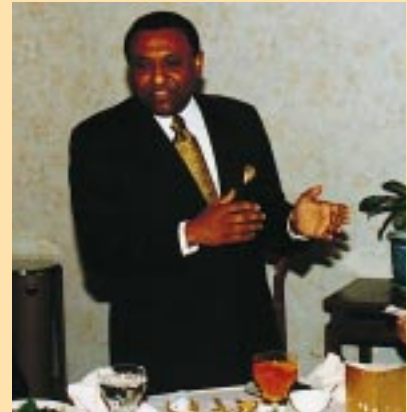
Dr. Kamil Idris

Projects to go ahead with the establishment of a Global Information Network, and to increase automation in the PCT and Madrid systems, have been blessed by our member States. In general, the international