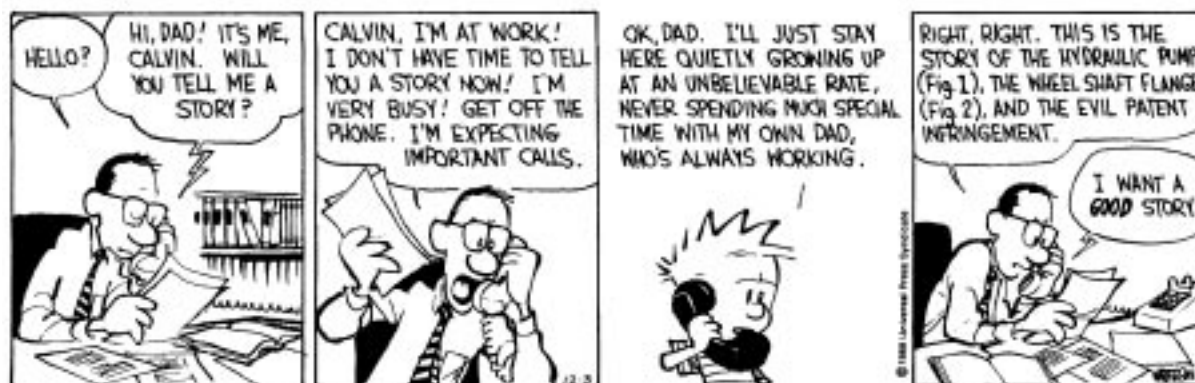
Calvin and Hobbes © Watterson. Reprinted with permission of Universal Press Syndicate. All rights reserved.