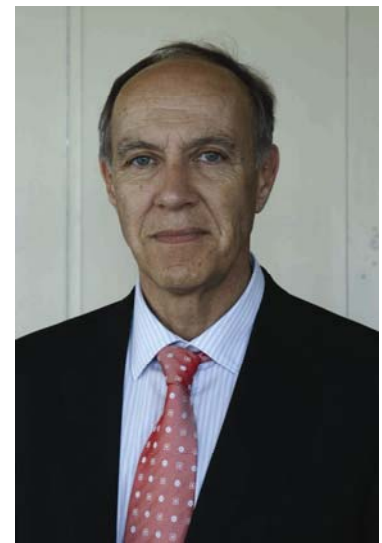
Mr. Francis Gurry, WIPO's new Director General

Representatives of the WIPO member States congratulated Mr. Gurry on his appointment and highlighted his wealth of experience in intellectual property and the professionalism that he brings to this position.