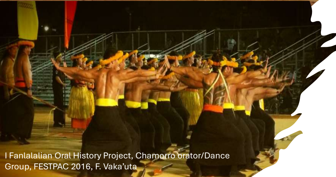
I Fanlalian Oral History Project, Chamorro orator/Dance Group, FESTPAC 2016