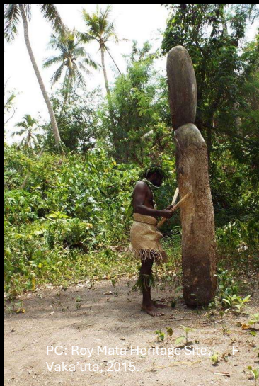
PC: Roy Mata Heritage Site, Vaka'uta, 2015