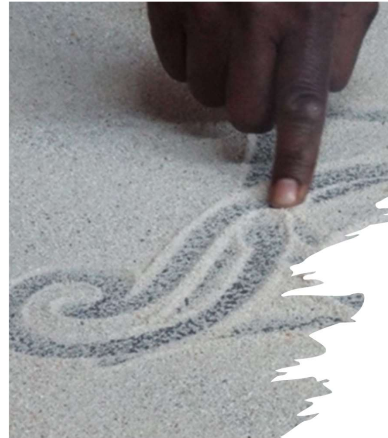
PC: Sandroing at Vanuatu Cultural Centre, F Vaka'uta, 2015.