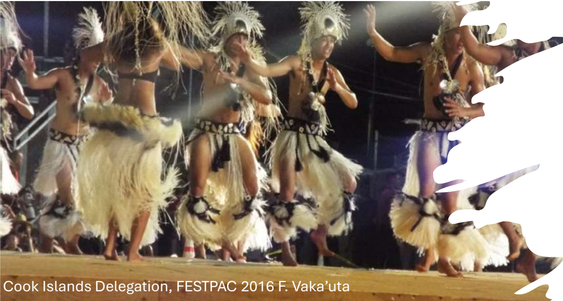
Cook Islands Delegation, FESTPAC 2016 F. Vaka'uta