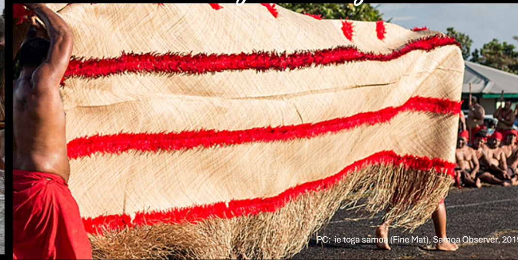
ie toga sāmōa (Fine Mat), 2019