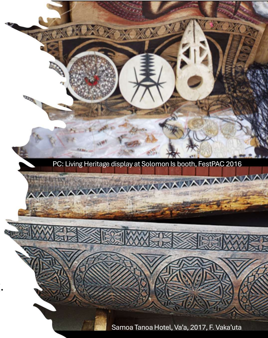
PC: Living Heritage display at Solomon Is booth, FestPAC 2016