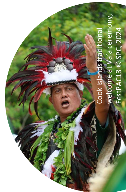
Cook Islands traditional welcome at Va'a ceremony, FestPAC13

Traditional Heritage (Knowledge & Experience), Traditional community-based approach, User-Agreements, Public notification, ABS Committee & Fund