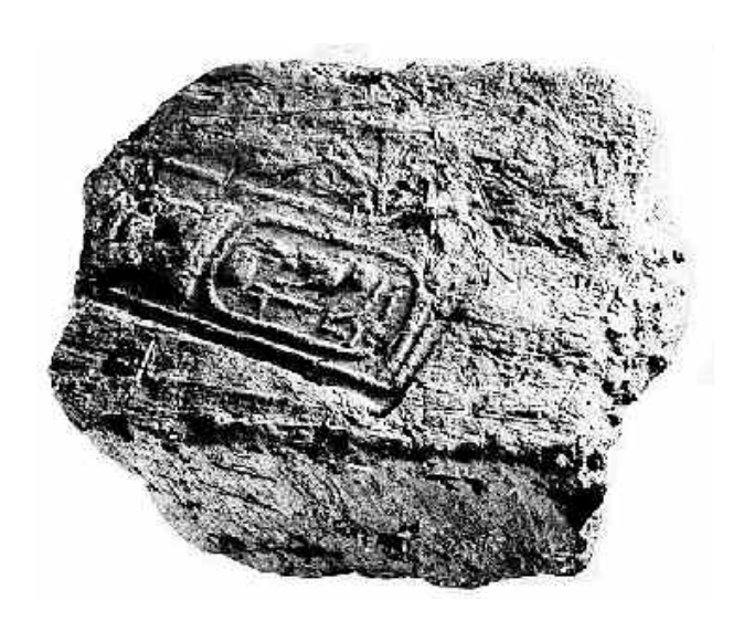
Egypt: Ramses II cartouche on a sun-dried mud and straw brick. Dynasty 19, 1279 – 1212 BC

WIPO ASEAN Seminar, Vivien Irish, NXT plc