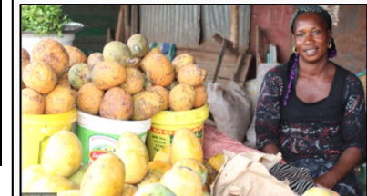
Madd (or Saba zambalensis) is a wild species of fruit, a berry with a hard, yellow peel that can be found predominantly in the woodlands and certain savannas of Burkina Faso, Senegal, Guinea, Guinea-Bissau, Mali, Ghana and Côte d'Ivoire. The plant is a climbing vine with tendrils that allow it to cling to the trunks and branches of trees in the forest, where it grows wild.

https://www.wipo.int/ipadvantage/en/details.jsp?id=11582