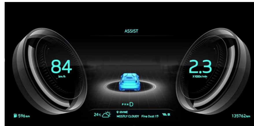
KRD 30-1164350 image for Information display