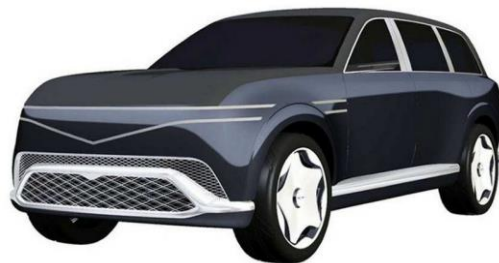
image for Information display