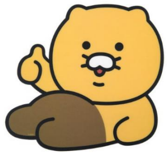
“digital image with utility”