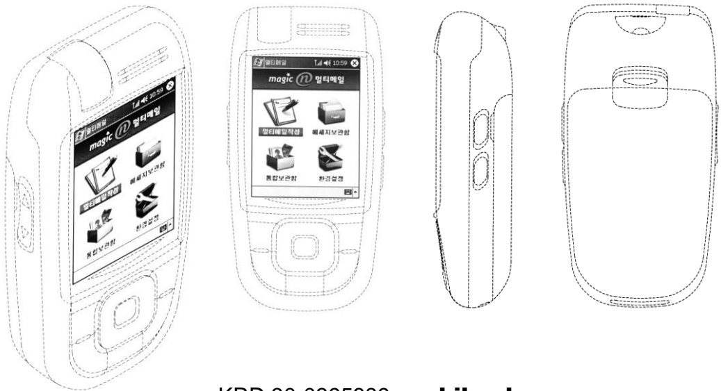
KRD 30-0395889, mobile phone