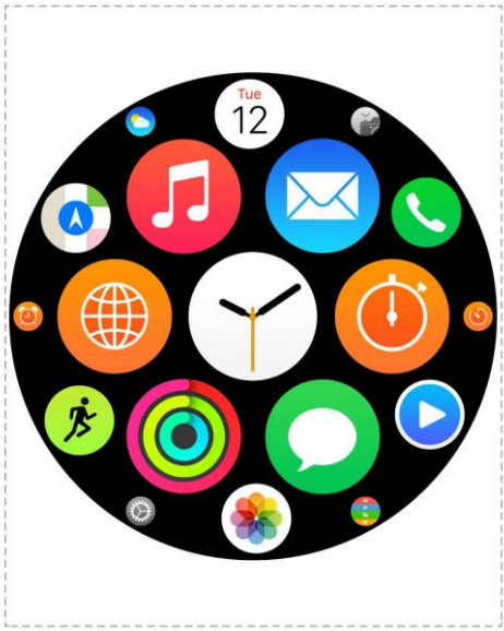
KRD 30-0845359, display panel