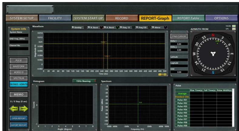
KRD 30-1161152 image for Information display