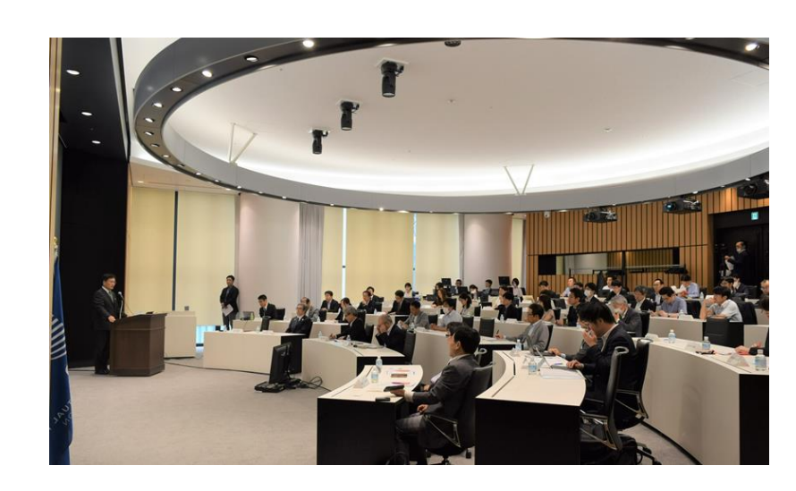
Scene of the Venue