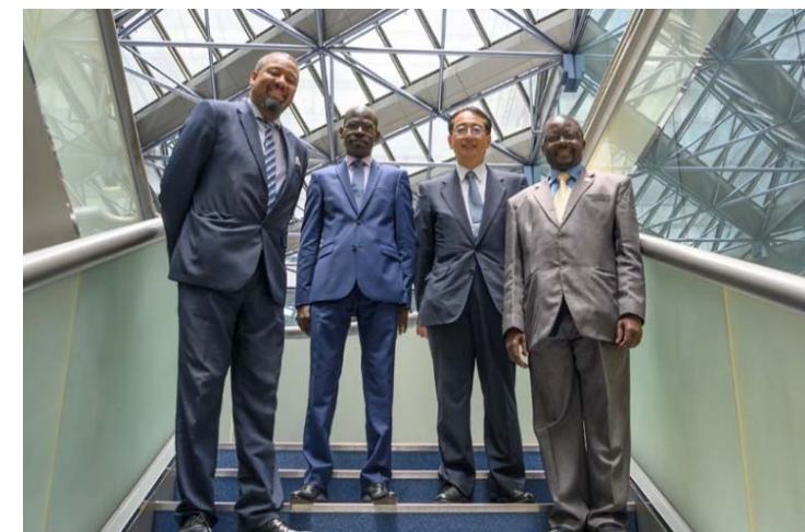
(Attendees of the Policy Dialogue)