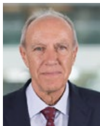
Mr. Francis Gurry, Director General, World Intellectual Property Organization, Geneva, Switzerland

Francis Gurry is an Australian lawyer who has served as Director General of the World Intellectual Property Organization (WIPO) since October 1, 2008.