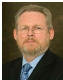
H.E. Mr. Rob Davies, Minister of Trade and Industry, Ministry of Trade and Industry, Pretoria, South Africa

Mr. Gurry joined WIPO in 1985 and has held various positions in its Secretariat, including Legal Counsel, Assistant Director General and Deputy Director General. He holds Law degrees from the University of Melbourne, a PhD from the University of Cambridge and is an honorary professor of, and holds honorary doctorates from, universities in many countries. He is also the author of a number of publications, one of which has become a standard legal text in the UK and is published by Oxford University Press as Gurry on Breach of Confidence .