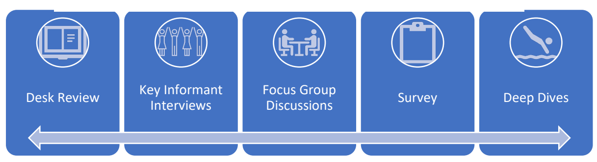
Figure 2. Methods for Data Collection

26. The methods of the proposed review will include the following: 1) Desk Review; 2) Key Informant Interviews; 3) Focus Group Discussions (providers and beneficiaries of Technical Assistance, other stakeholders); 4) A survey sent to all Member States and key partners; 5) Deep dives, which are case studies detailed in this section. These methods are presented in Figure 2.