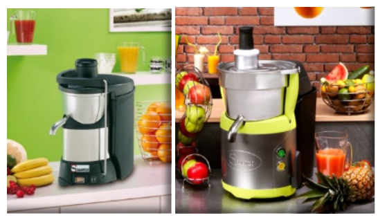
Juicers N°50 and 68