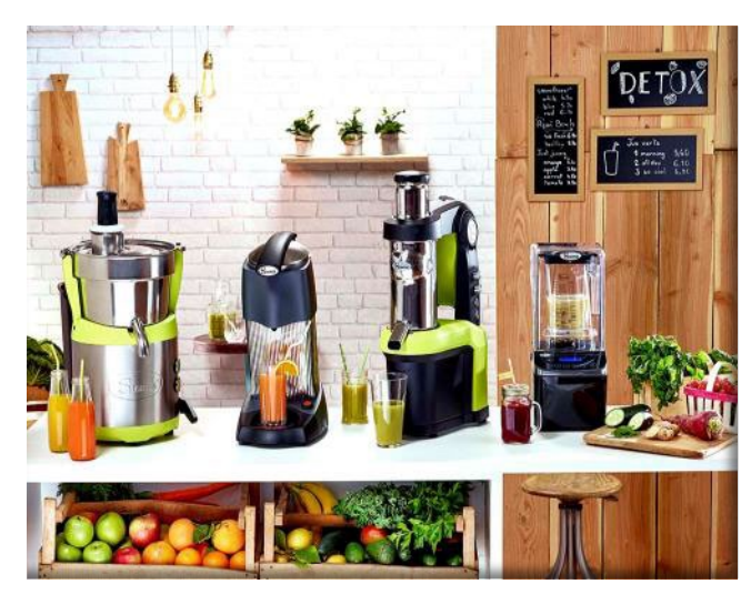
Full Juice Bar Solution