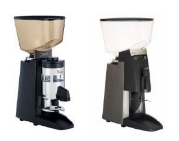
« Silence » Coffee grinders N°40A and 55