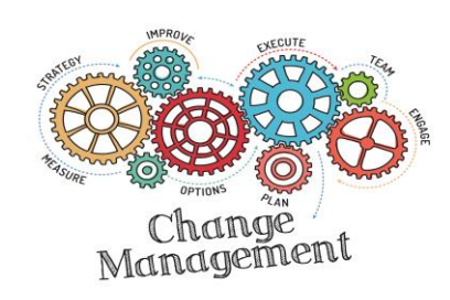
CoP – Change Management