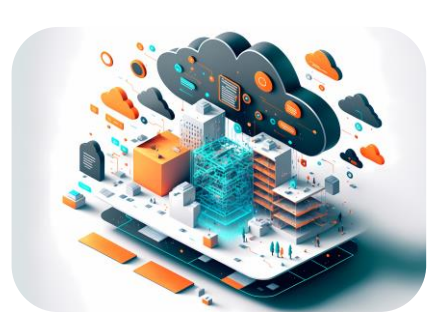
Architecture Design Task Force (ADTF)