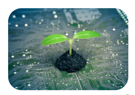
Sustainable ICT WG (>)