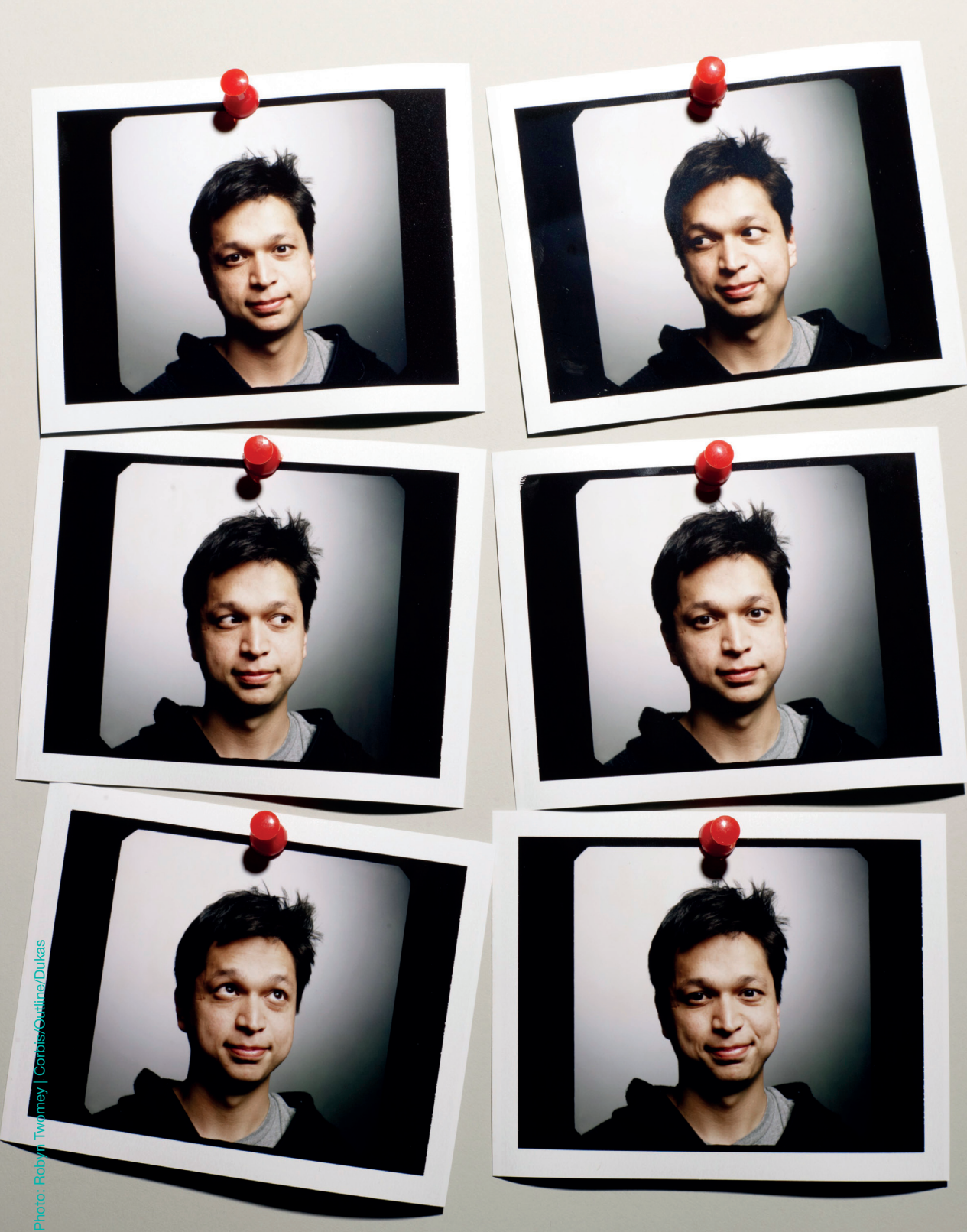
Ben Silbermann Internet entrepreneur