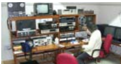
Digitising at the Archives and Research Centre for Ethnomusicology in Gurgaon, India

WIPO has commissioned surveys of these existing resources and practices. A selection of short case studies drawn from the surveys has been prepared.