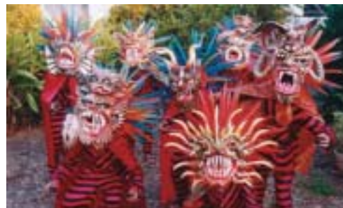
Dirty Devils Dance, Panama

Whether to use new technologies and IP tools to participate in the information economy is tied to the overall cultural and economic goals of the tradition bearers themselves, which only they can decide upon.