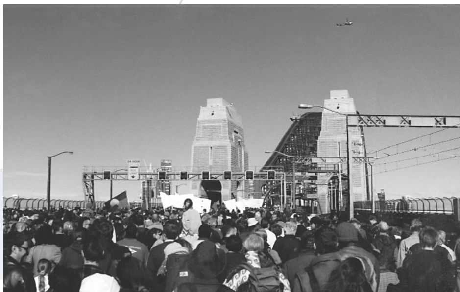
Corroboree 2000 Sydney Harbour Bridge walk, May 2000