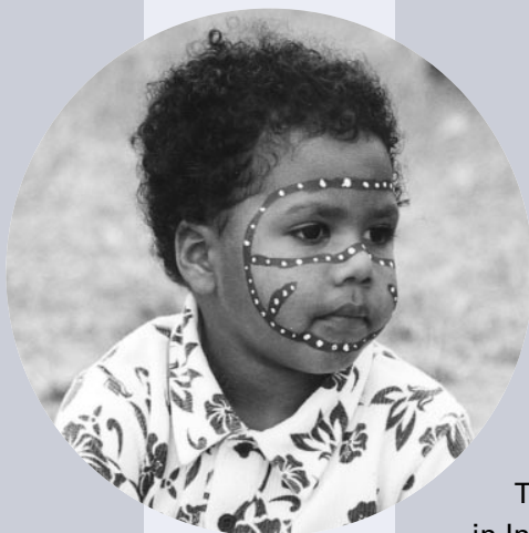
One of the thousands of participants at Survival Day 2000

MANY ABORIGINAL AND TORRES STRAIT ISLANDER communities are keen to talk to journalists, to tell their stories and express their viewpoints on different issues. This booklet has been produced to provide you with an insight into the complexities of reporting on and interacting with Indigenous communities.