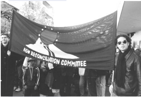
Corroboree 2000 Sydney Harbour Bridge walk, May 2000