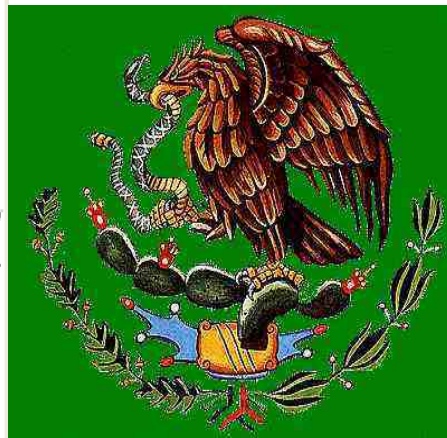
Mexican coat of arms