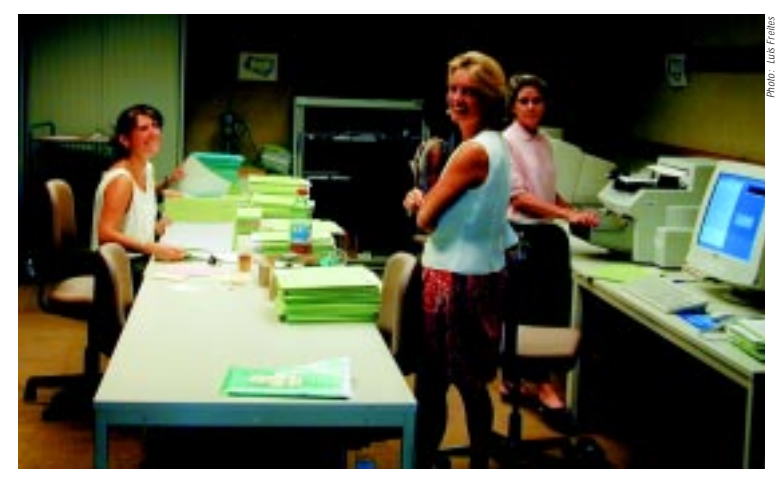
The centralized scanning room for the IMPACT Project has already started to replace the previous labor intensive cut-and-paste method used in the PCT to process incoming documents.

The first phase of the IMPACT (Information Management for the Patent Cooperation Treaty) Project, which focuses on the scanning and distribution of bulky PCT-related documents to national offices in electronic form, is set for progressive implementation during the fourth quarter of 2001.