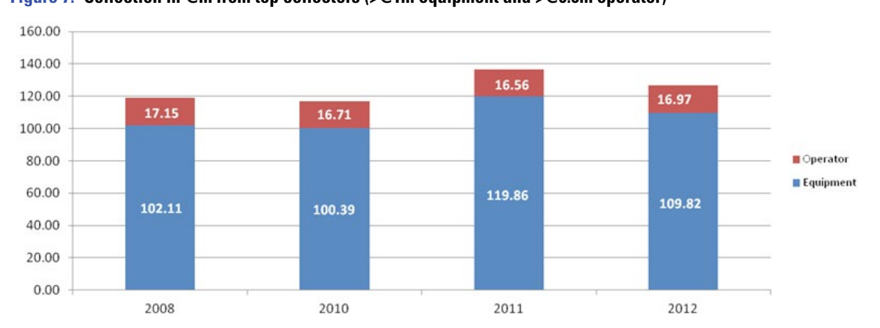
Figure 7: Collection in €m from top collectors (>€1m equipment and >€0.6m operator)

Tables 17 and 18 analyse the countries with the highest equipment and operator levy collections between 2007 and 2012. Our conclusion is that in both cases overall collections have shown no clear trend either up or down, fluctuating no more than 15% in the case of the equipment levy and 12% in the case of the operator levy. This is after making due allowance for the distorted figures for Germany in 2009 and 2007. In 2009, the total of approximately €473 million is accounted for by a back payment for multifunction machines for 2002 to 2007, following the resolution of a legal dispute. In 2007 by contrast, German collections were relatively low because ongoing tariff negotiations were not completed within the year. However, a relatively flat level of total revenue can be seen as a positive outcome in view of the world financial downturn since 2008. See also Figure 7.