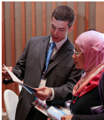
ScreenSingapore trade-accredited participants at the Masterclass.