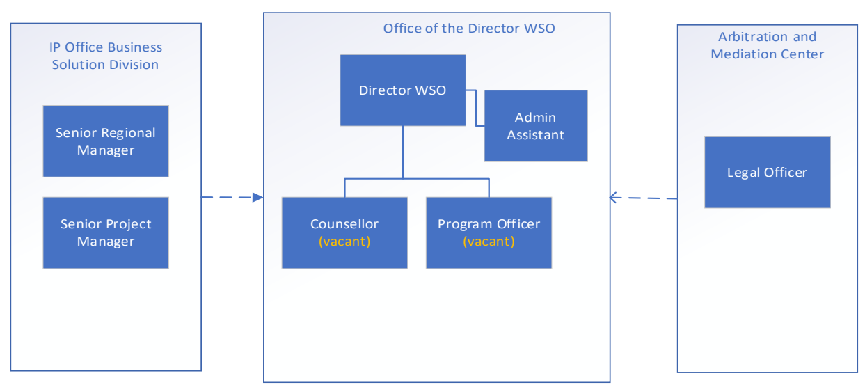
Figure A: Reporting Structure of the WIPO Singapore Office