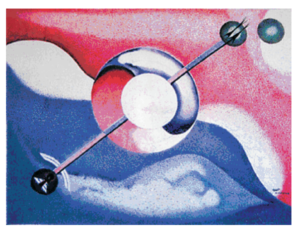
'Pôle fédérateur', by Papa Oumar Fall ('Pof'), 530mmX480mm, 1 January 2002.