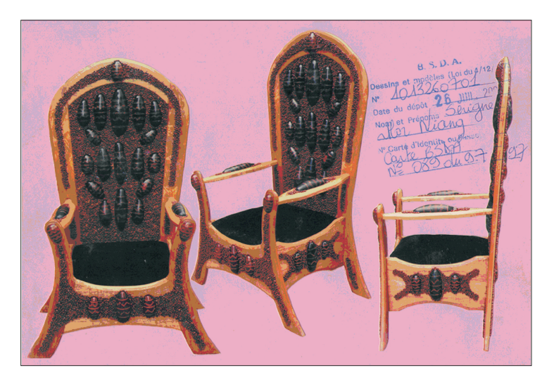
'Gangunaay' means 'throne' in Wolof, the national language of Senegal. Mosaic on wood, made of fruit and seeds of the baobab tree. The throne has been conceived following the shape of the baobab tree. Dimensions: 1.40 m by 0.70 m.

The idea of protecting his works came very early to Mara, even before he had registered at the Fine Arts Institute in Dakar, which in 2002 awarded him a national diploma with honours. Mara wanted to reconcile the need – faced by any genuine visual artist – to exhibit his works with the underlying threat that his artistic expressions could be copied once he would make them publicly known. This early decision is commendable, particularly as he lacked information on IP issues. He later discovered that this is often the case for visual artists in his country, who either are unaware of or neglect to use the tools provided by the IP system, unlike artists in the music sector, who make better use of the IP system.