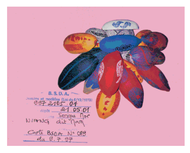
'Pile of shells', pile of fruit cut out and hot/cold contrast-painted, following the concept of baobab fibres and seeds, intended for home furnishing. Dimensions: from 25 to 30 cm, by from 10 to 12 cm.

Source: E-mail correspondence between the artist and ITC (December 2002-January 2003). Website: www.baobabfruitco.com.