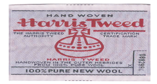
For more information, see the Harris Tweed Authority website: www.harristweed.org

and thread densities) have been complied with, it is stamped with the Certification Mark – or 'orb' mark as it is known throughout the world. The orb stamp is the mark of authenticity and the label confirms it.