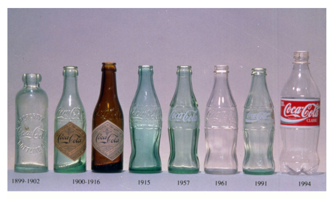
Coca-Cola Bottle Evolution

This is the case of the Coca-Cola bottle which is a three-dimensional mark or trade dress.