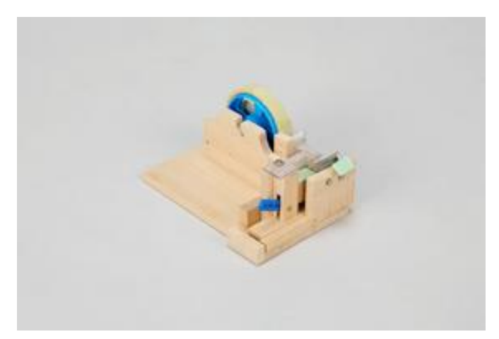
JPO Commissioner's Award