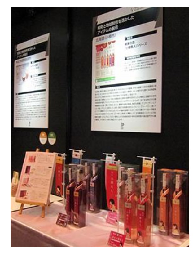
Items that make use of IP