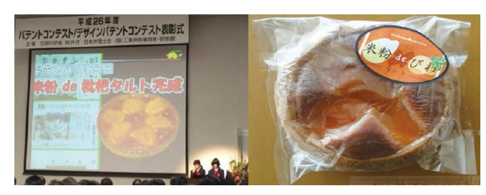
JPO Award Winning Product: "Gluten-free Tart"