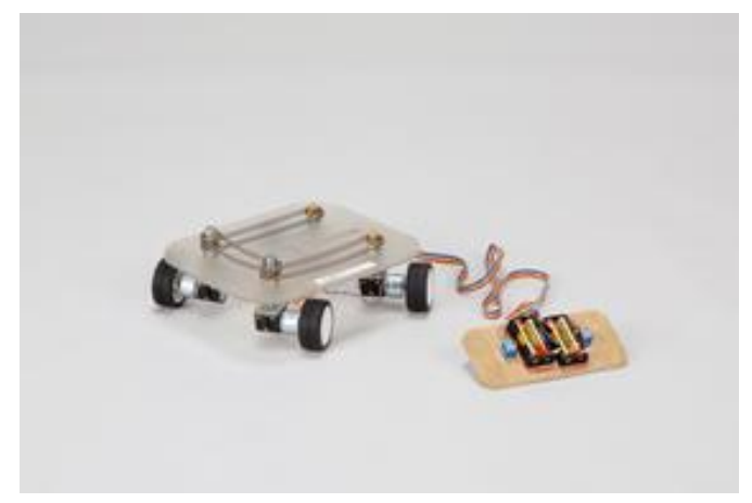
Imperial Memorial Award