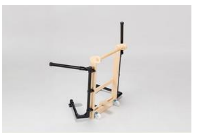
Prime Minister's Award