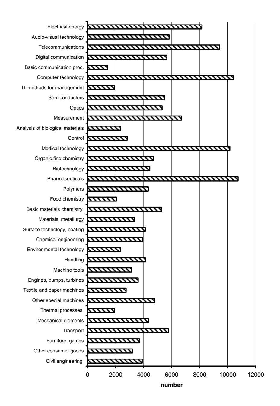
Figure 1: Distribution of International Applications of the priority year 2005 on technology fields<sup>5</sup> according to the definitions of Table 2, absolute numbers